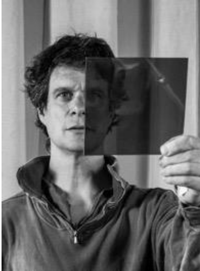
Foofwa d'Imobilité https://www.foofwa.com/