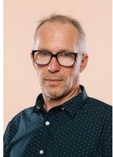
Marco Berrettini www.tutuproduction.ch