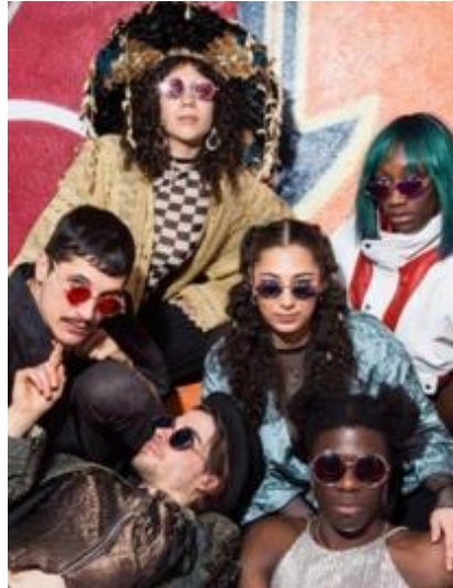
Cie des Marmots & Collectif Ouinch Ouinch www.ciedesmarmots.com/